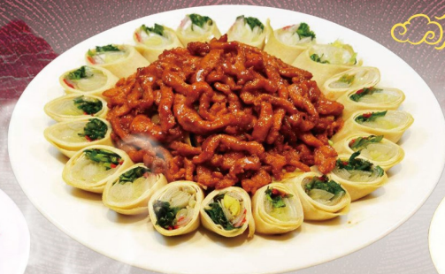
Chicken with Chinese Sauce