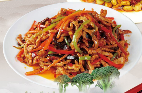
Fish-flavored Shredded Pork